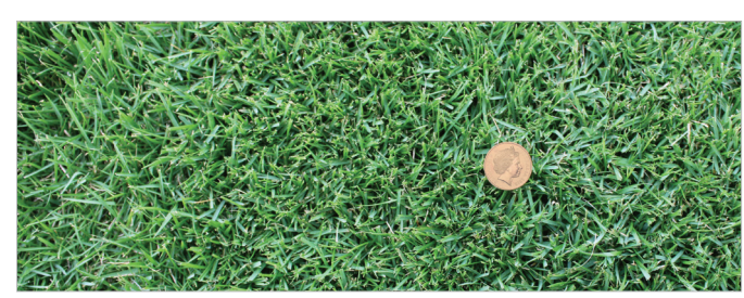
Fig 2. $2 coin on wide shot of grassed area.