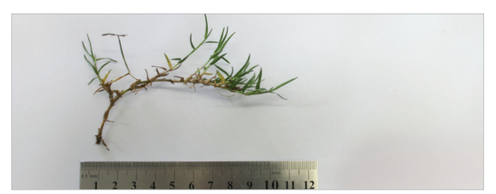
Fig 3. Close-up of live stolon.